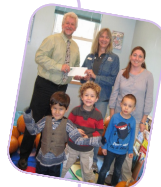
Receiving a generous donation from Longfellow's Greenhouses

For all of your support, we extend our appreciation - and encourage everyone in our community to support the businesses that support the children of Central Maine!