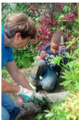
As you can see from the photo, the children love to get down in the dirt and help out!