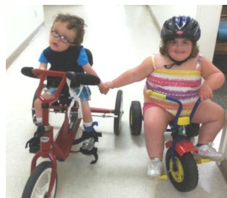
Friends riding bikes together.